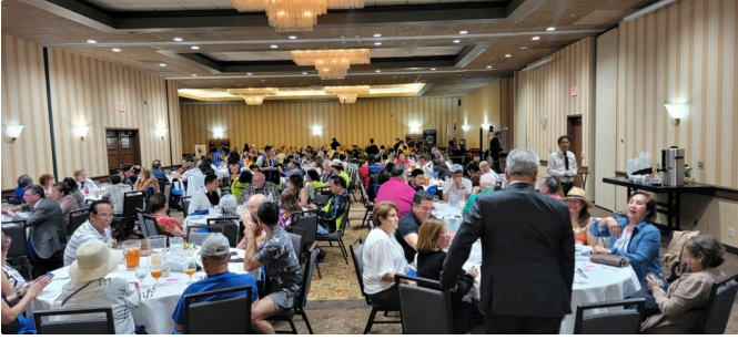
5-17-24 - District 4-C4 Convention, Red Lion Hotel, Redding - View of Friday's dinner gathering.