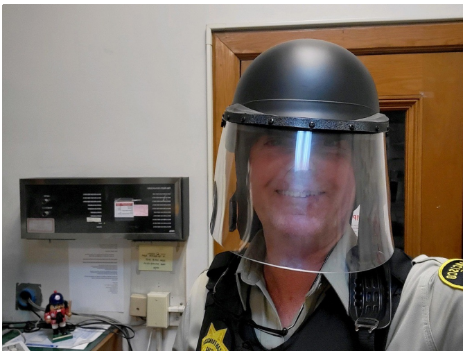
November 2023 - Steve Martin suited up and ready for action in San Francisco.