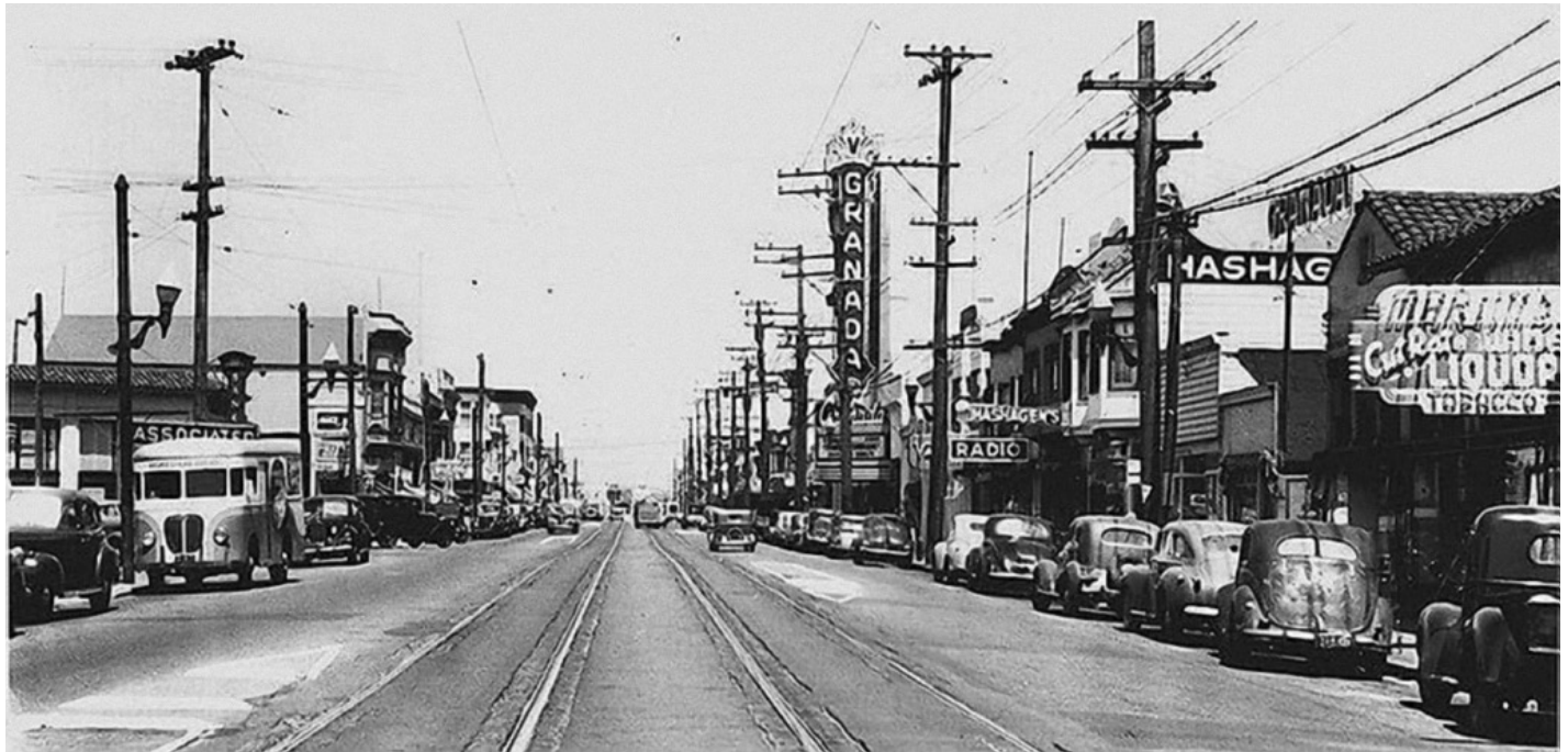
From Facebook - Mission Street, looking north from near Persia Avenue in the 1940s.